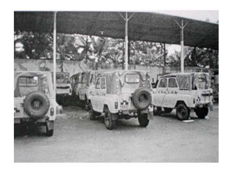
Photo 1: 19 UAZ-3151 vehicles at the Ministry of Defence in July 2005