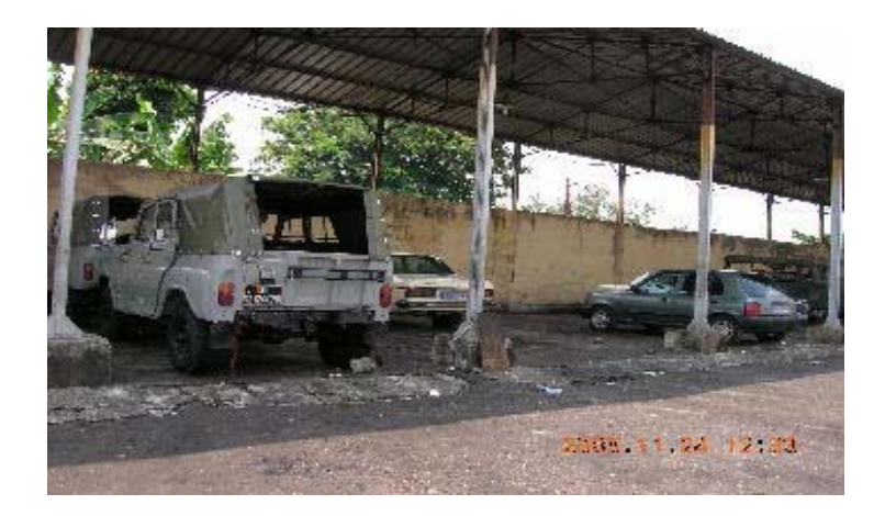
Photo 2: Two UAZ-3151 vehicles at the Ministry of Defence in November 2005